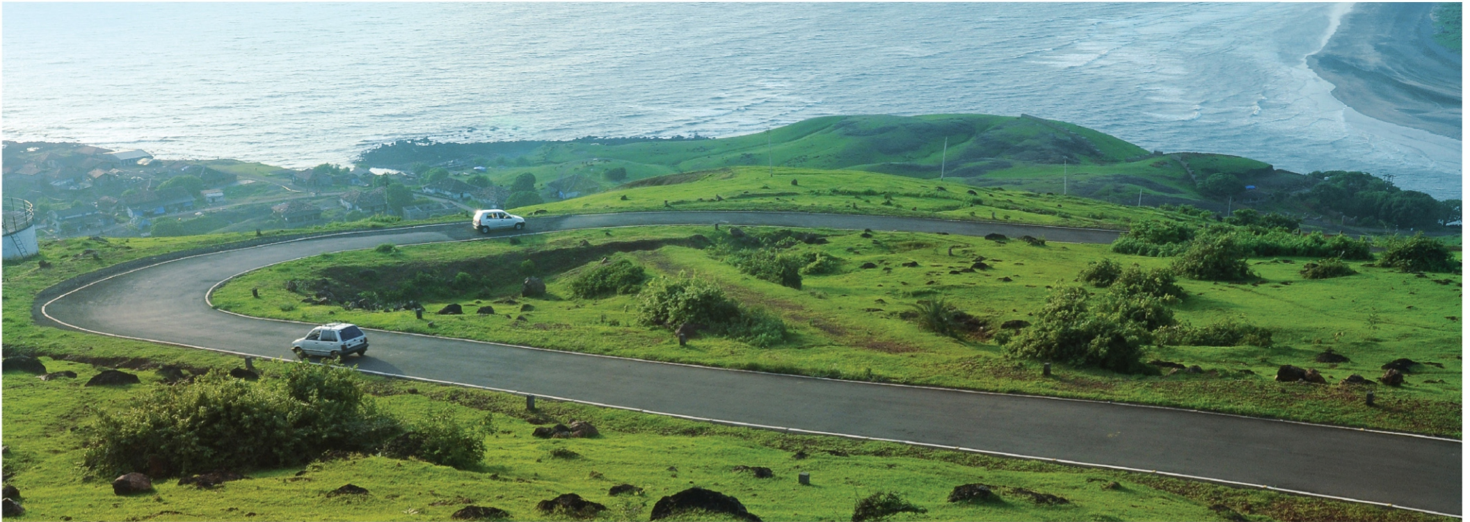
Scenic view at Dapoli