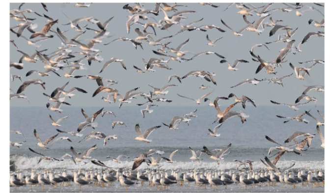
Seagulls near Dapoli